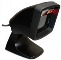
HIGH VOLUME BARCODE SCANNER