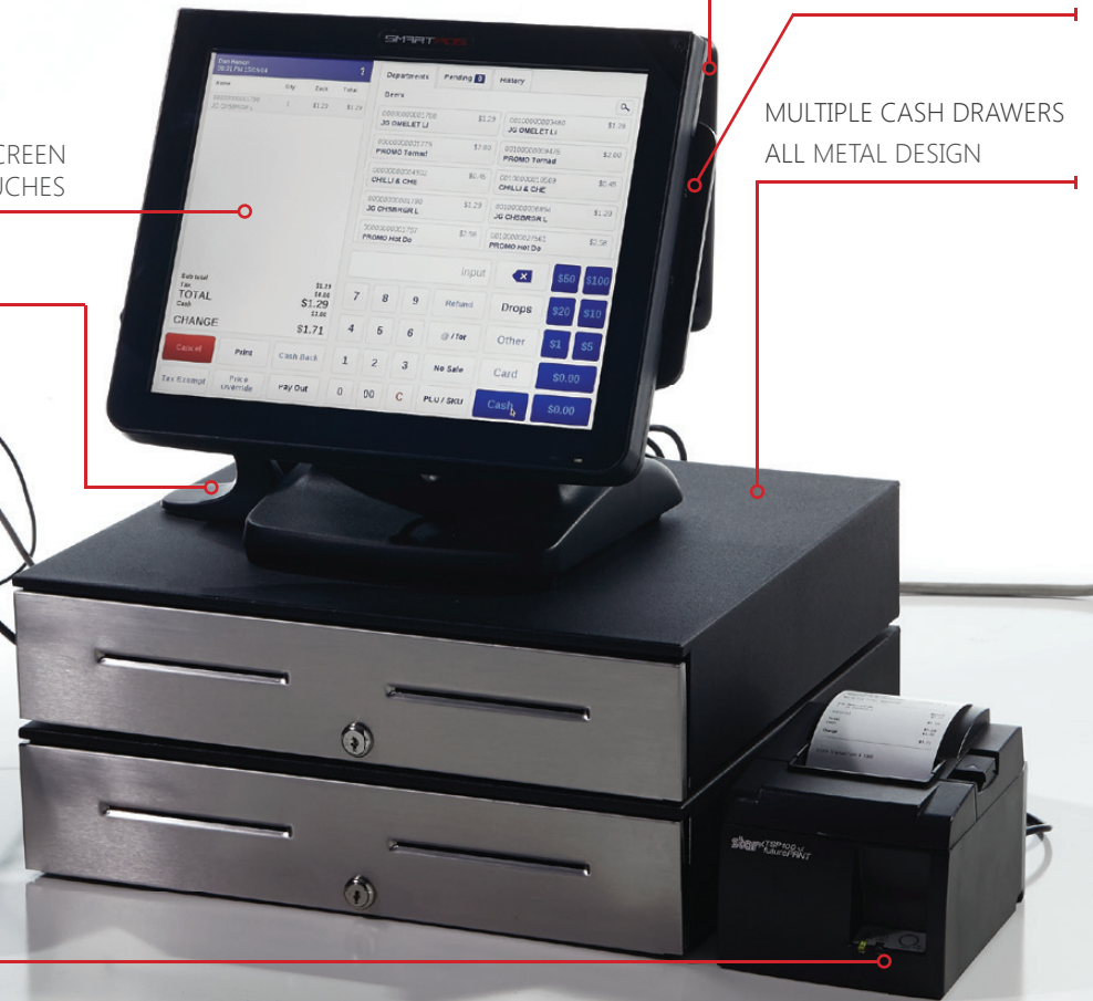
CAPACITIVE TOUCH-SCREEN FOR MILLIONS OF TOUCHES