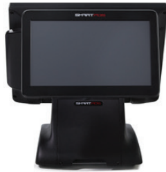
11" CUSTOMER SCREEN FOR MARKETING OFFERS AND INFORMATION